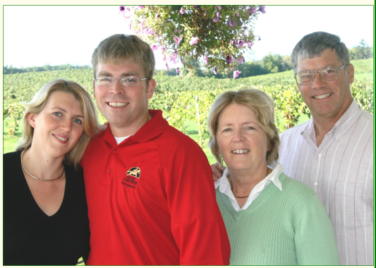
Rare & Distinctive Finger Lakes Wines since 1981